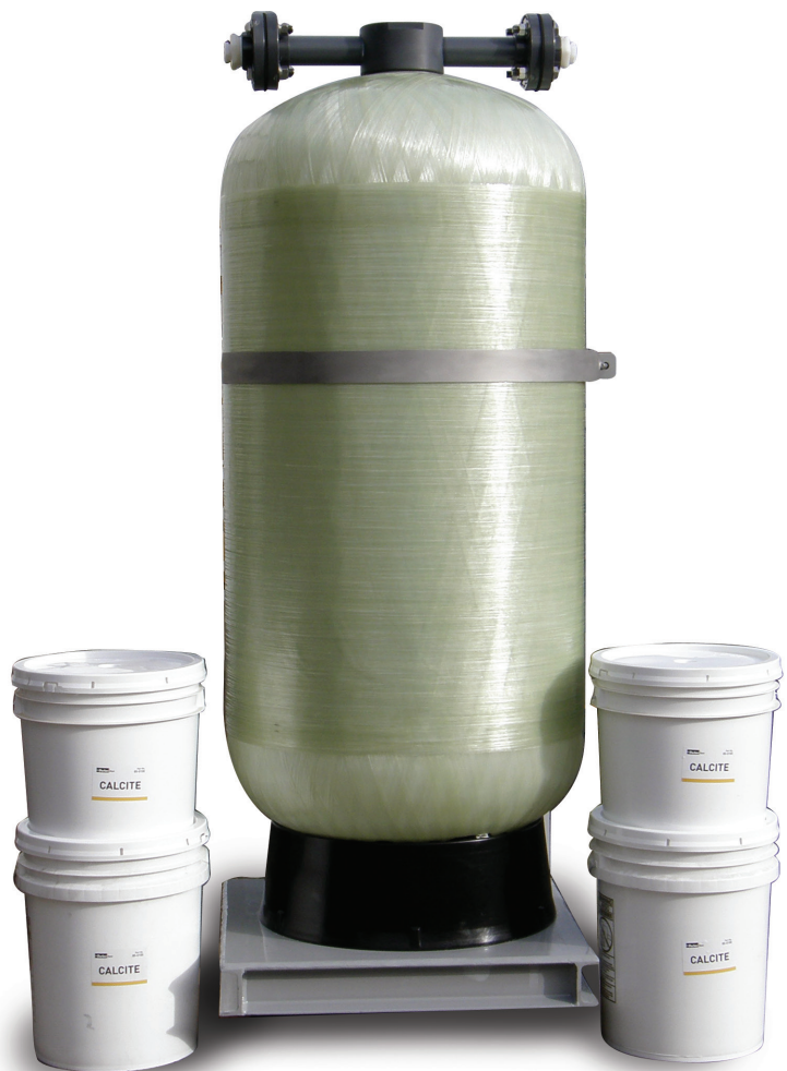
Parker Water Purification RMF-40

phone (310) 608-5600 fax (310) 608-5692 waterpurification@parker.com www.parker.com/waterpurification